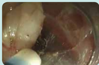
Tumor resection after tunneling

The HybridKnife is also the instrument of choice for Peroral Endoscopic Myotomy (POEM) . After elevation of the mucosa, the combination of the electrosurgery and the waterjet functions enables selective tunneling through the correct layer up to the lower esophageal sphincter and beyond. Following myotomy of the circular muscularis, the cut is covered by the remaining intact mucosa and the incision site is sealed with clips. 4-6