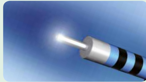
Marking, incision/dissection and coagulation using the electrosurgical tip