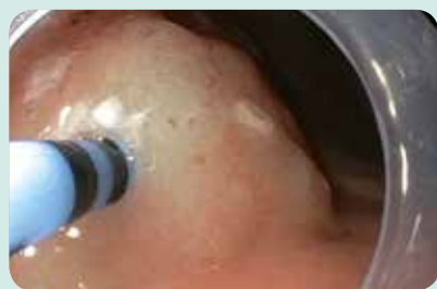
Elevation prior to ESD

The integrated functions of waterjet surgery and electrosurgery in the HybridKnife enable new endotherapeutic procedures in gastroenterology. The elevation prior to resection or tunneling, which is available at all times, as well as the electrosurgical multi-functions provide the decisive advantages.