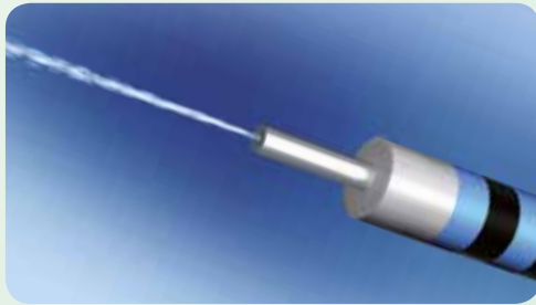
Elevation using the waterjet function