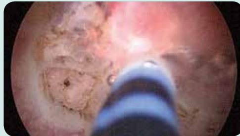
En bloc resection of the bladder tumor