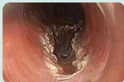
The muscularis after myotomy

Thanks to elevation, the muscularis layer is protected from mechanical and thermal perforation. 1-3